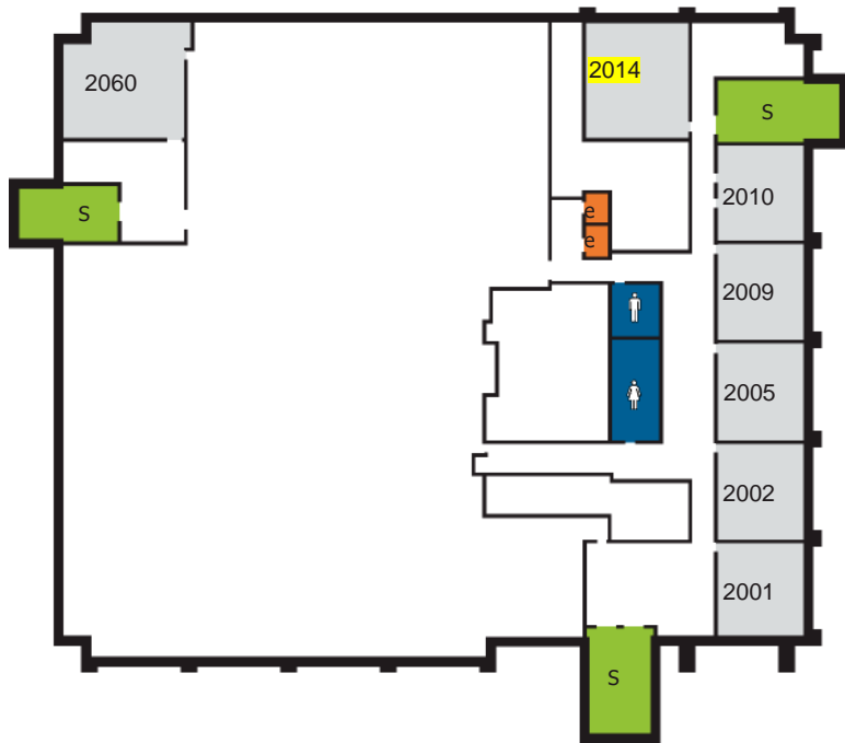
Education Building Second Floor